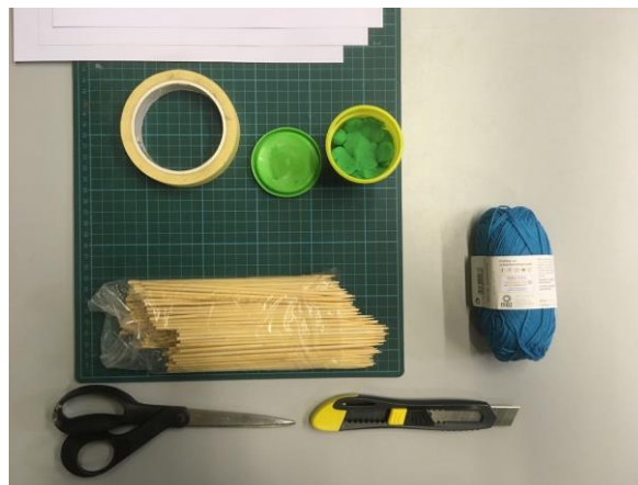
Figure 3. Materials and supplies to be brought by the students in advance

At the start of the current academic year, we organised a starters afternoon with an assignment for a model for a refugee shelter. Students were asked to bring basic materials and supplies in advance: sticks (for example skewers), plasticine (type 'Play-doh'), a cutting knife, a 'Playmobil' figure, rope (cotton crochet thread), a cutting mat (A4 or A3), pencil and paper for sketching, scissors, and adhesive tape (Figure 3).