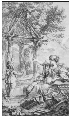
Figure 1. Frontispiece of Marc-Antoine Laugier: Essai sur l'architecture 2nd ed. 1755 by Charles Eisen (1720–1778). Allegorical engraving of the Vitruvian primitive hut

The above raises the fundamental question: what are the most acute contemporary challenges for architectural design on a global scale? In a context of soaring inequality, ecological collapse and mass-displacement, the perdurance of violent wars, worsened by a planetary environmental crisis, threatens human society at an existential level [2]. Not only human conflict, but also the consequences of global warming, including mounting natural disasters, desertification, and sea-level rise are displacing more people as ever before from their homes and communities [3]. These people displaced in one place often arrive as refugees elsewhere, in search of safe and stable living conditions [4]. Given the resulting growing need for shelter and reception in Europe, and not the least in the Flemish and Belgian context, the design of humanitarian refugee reception spaces such as emergency shelters, surfaces as an exemplary design challenge to confront students in Architectural Engineering with the social importance and repercussions of technical solutions and propositions.