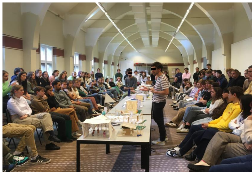
Figure 4. All designs were discussed together with the students

At the end of the afternoon, all designs were reviewed and discussed together with all the students. Their designs ranged from tents with one small living space to mini houses with several rooms. (Figure 5) Challenges as formulated above were discussed, while also the importance of combined challenges for real design quality were mentioned. (Figure 4) Also, for example, the fact that resources made available for emergency housing are almost always less than the needs in contemporary cities, was debated. The 'challenge' is therefore to design an emergency home that, when applied a specific limited open area, would provide the most 'humane' residence possible, for as many refugees as possible, while at the same time deploying as few resources as possible. Points of debate thus also questioned how certain proposals designed shelter structures as simple/minimal/compact as possible (including through shared functions...), while inevitably having to balance this with an urgent need to provide hospitable and dignified homes for violently displaced populations. Additional discussion focused on building efficiency, including the use and possible reuse of building materials, sustainability, flexibility, etc., while still dedicating attention to living quality and care.