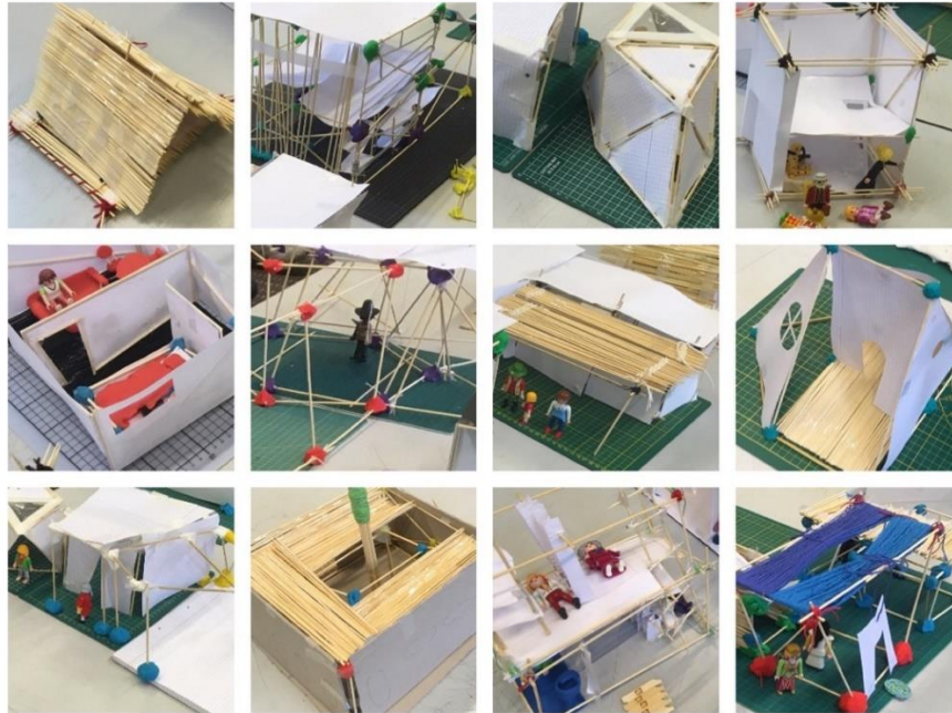
Figure 5. At the end of the afternoon, student designs were reviewed