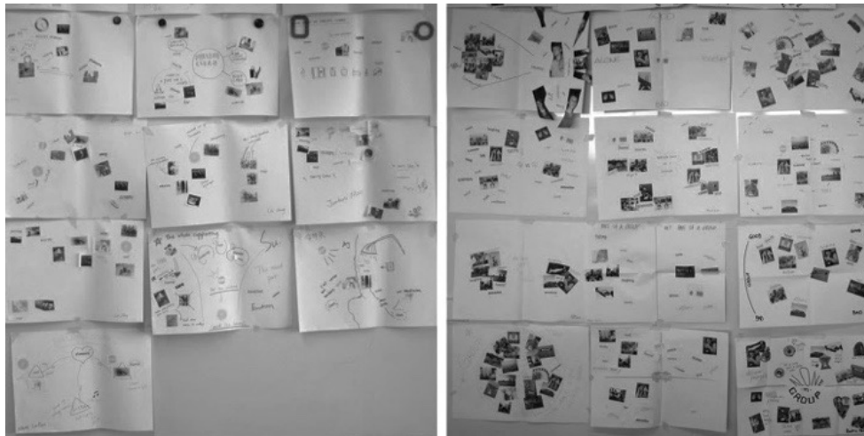
Figure 1. Some collages made by East Asian group (left) and International group (right)

When examining the collages made by Western and Eastern groups, those of the Western groups were considered as ‘more creative’, ‘personal styles’ and ‘diverse’; comments to those of the Eastern Asian group were ‘modest, ‘restricted’ and ‘with many white spaces (unfinished)’.