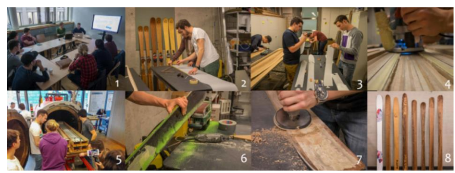
Figure 2. Pictures from the ski-building process: 1. Behavioral design and CAD, 2. Workshop setup, 3. Cutting ski bases, 4. Routing the wood cores, 5. Curing in an Autoclave, 6. Sanding ABS sidewalls, 7. Sanding wooden top sheet with logo inlays, 8. Final skis

friendliness of wood was always clarified, the overall visual design of the ski was the most important argument for all wooden sidewalls. The functional disadvantage that wood might need some treatment (sanding, oiling) after some time was not important. The main reason for choosing ABS sidewalls by one student was visual - the contrasting colours. During the building process, students experienced that ABS is less convenient to work with; the smell of the heated plastic and the clogging up of power tools left a negative impression on choosing this material again in favour for wood, mostly for health reasons (Figure 2 picture 6).