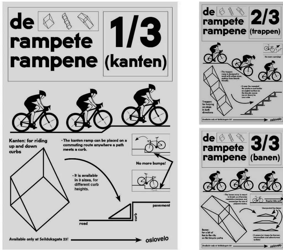
Figure 5. Priming and information posters for Rampete Ramps by James Duncan Lowley