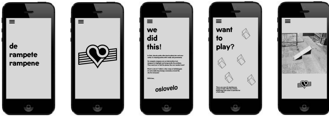
Figure 4. APP which explains Rampete Ramps and give additional stimuli for use and further development