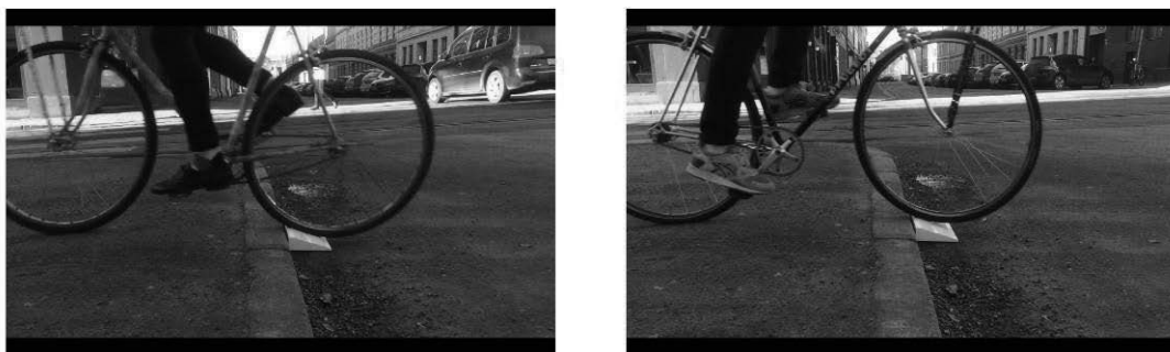
Figure 3. Rampete Ramps in use